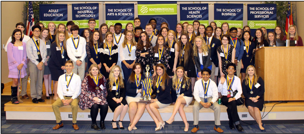
TCCHS FBLA chapter retained its region title for the sixth consecutive year. The club won top honors over 25 other counties in the FBLA Region 1 Leadership Conference and Competition held in Moultrie.

Thomas County Central High School's Future Business Leaders of America chapter continues to dominate its region's competition.